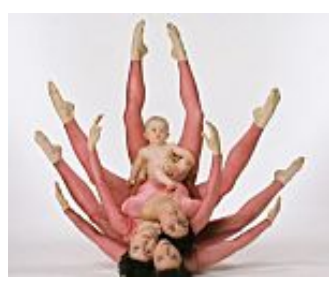
20 Mortifying Family Photos Parent Media