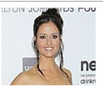
All Grown Up: Hollywood's Fittest Former Child Stars Shape Magazine